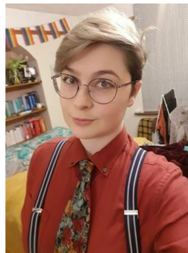
Local Party: West Norfolk Green Party