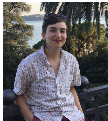
Local Party: Richmond and Twickenham Greens