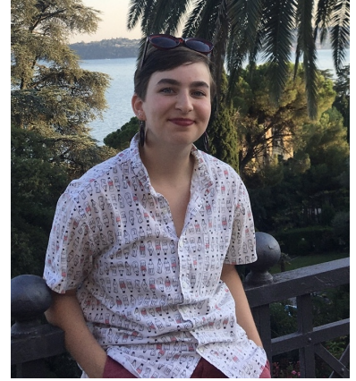
Local Party: Richmond and Twickenham Greens