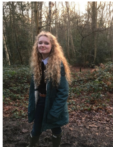
Local Party: Birmingham