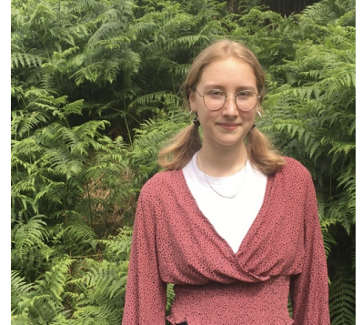
Local Party: Bristol Green Party

Which role are you applying for?: Young Greens Women Co-Chair