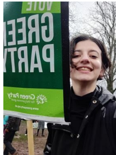
Local Party: Bristol