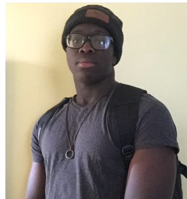
Local Party: North Surrey Green Party