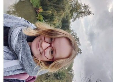
Local Party: Oxfordshire Green Party

Which role are you applying for?: Young Greens Women Non-Portfolio Officer