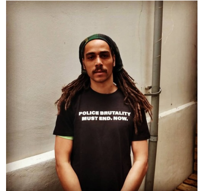
Local Party: Hackney

Do you self-identify as belonging to this Liberation Group? (Yes/No/Unsure): yes