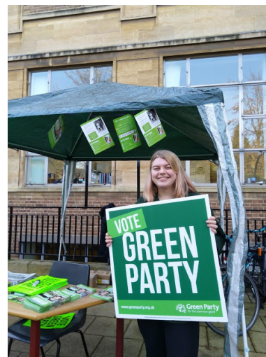
Local Party: Bristol

Do you self-identify as belonging to this Liberation Group? (Yes/No/Unsure):