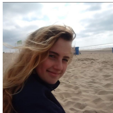
Local Party: Bristol Green Party

This year I have been a European Green Party delegate for the Green Party of England and Wales at the joint annual Council. I learned the ins and outs of the European Green Party and began developing networks with other European Young Greens while helping develop joint policy. I will continue to grow these relationships in order to deliver my campaign promises.