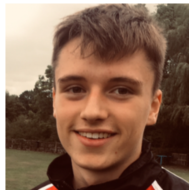
Local Party: Stratford-on-Avon District

Which role are you applying for?: Structures and Procedures Committee (SPC) Member