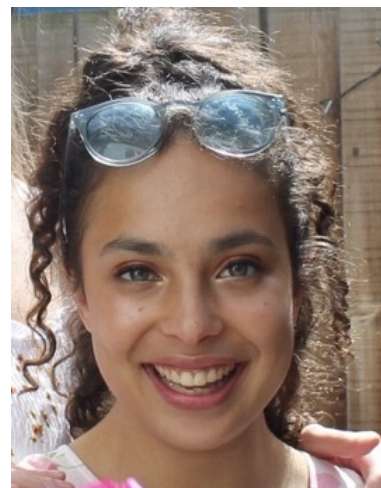
Local Party: London Young Greens

Whilst Coronavirus has undoubtedly changed the way we interact, I am committed to the development of digital campaign strategy. For many people during lockdown, social media proved to be an