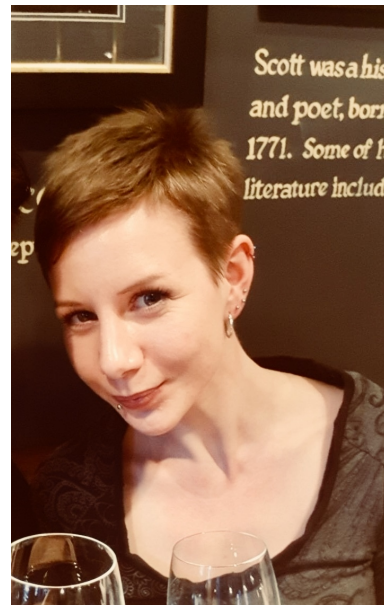
Local Party: Bromley