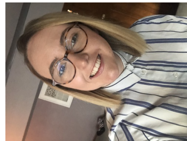
Local Party: Calderdale

Which role are you applying for?: Green Students Committee Co-Convenor