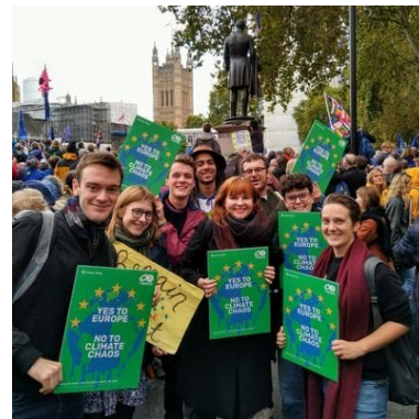
Local Party: Bristol