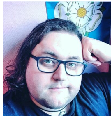
Local Party: Rotherham

In my half a decade in the Young Greens I have founded a local group, co-chaired a Liberation Group, Co-chaired a Region, and now I am President of a Young Greens University Society. The experiences I have gained across the board have resulted in me having a varied perspective of what the Young Green's is doing right, and what needs to be done to improve when it comes to supporting and coordinating Groups and Societies. In addition to this I have over a decades experience as an activist on a range of issues including Fracking, HS2, Immigration, Religious Freedoms, LGBT+ rights, Republicanism, Nuclear Disarmament, and Anti-Fascism to name a few. I believe that the experiences I have had as an activist in a range of environments and issues mean that I have the expertise to deliver core skills and activist training throughout the year. There is now a power vacuum on the left of British Politics, lets reach out and fill it!