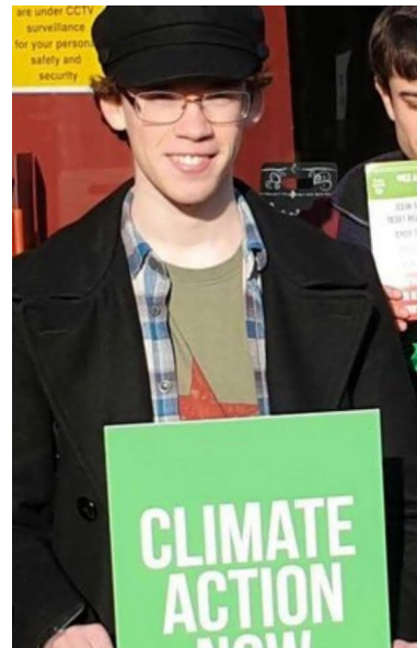
Local Party: Brent Green Party

Rydyn ni, pobl ifanc y byd, wedi etifeddu byd sydd yn marw. Mae trachwant a diogi y cyfoethocaf wedi ein melltithio i ganrif o drychineb hinsawdd - ond rydyn ni yn ymlaf dros ein hawl i fyw ac i fod yn