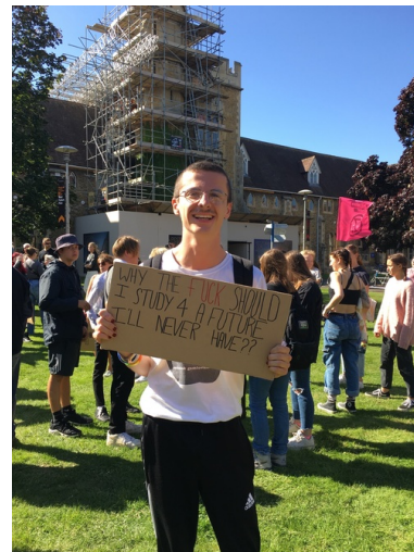
Local Party: Cheltenham

I am currently Chair of Cheltenham Young Greens, Treasurer of my University's LGBTQIA Society as well as Social Media Officer for my University's Green Team. The range of these roles highlights the scope of the transferable skills I have - such as organisation, communication, initiative and creativity.