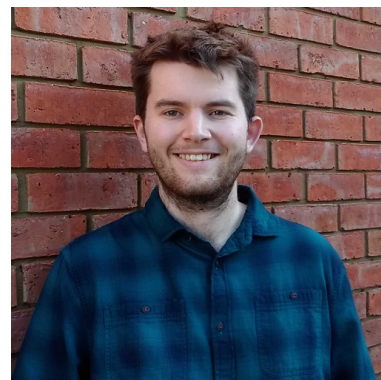
Local Party: Oxfordshire Green Party

Which role are you applying for?: Non-Portfolio Officer