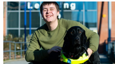
Local Party: Three Rivers Green Party

Which role are you applying for?: Non-Portfolio Officer