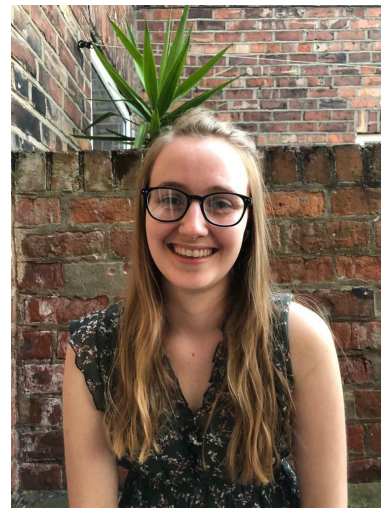
Local Party: York Green Party

I'm well-acquainted with the structures that limit changes within education and I know how to navigate them to effect change. I know how to work with large bodies of students and within Students Unions' to create and influence policy, elections and campaigns. I hope you'll vote for me to be Young Green Student Committee Co-convenor.